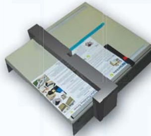
Creasers Manual and electric creaser that deliver top notch creases that are essential to digital printing

Digital Finishing Group 1260 Kempar Madison Heights, MI 48073