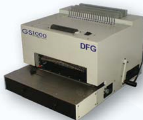
GS Series The only line of machines that fit coil, comb, and wire binding in one convenient, profitable package