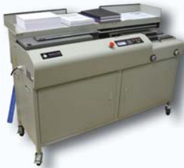
DigiPerfect 1000 full featured perfect binder with professional hard cover capabilities