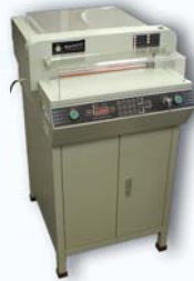
DigiCut Series Automatic electric paper cutters