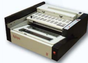
DigiExpress/DigiPro User-friendly, economical solution for total on-demand perfect binding. DigiPro has Hard Cover capabilities.